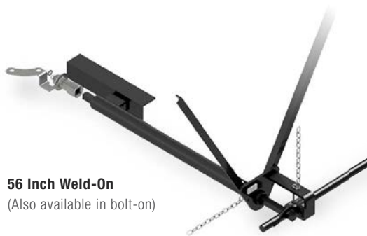
56 Inch Weld-On (Also available in bolt-on)