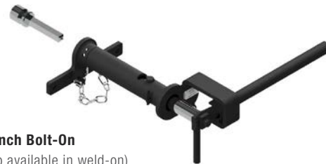
37 Inch Bolt-On (Also available in weld-on)